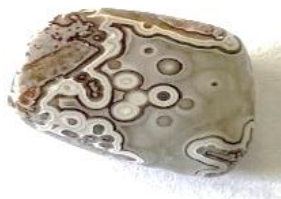
Mexican Lace Agate