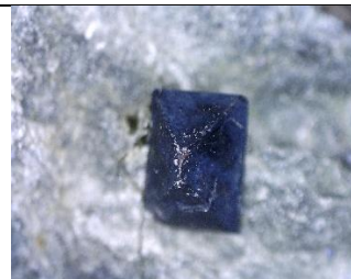
Benitoite