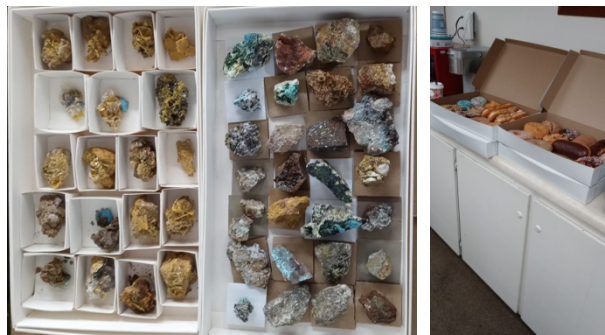
2 for a dollar minerals and donuts, what more can you ask for?