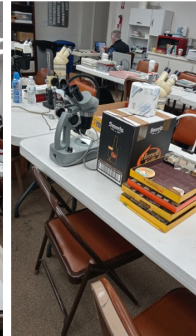
Carolyn was very, very busy with the sales!

Everyone had a great time, meeting with old friends and making new friends. The micromount tables had 2000 new minerals and once the word got out boxes of minerals were selling fast. We sold over 2000 minerals during this event, new minerals and 2 minerals for a dollar, the tables were busy for the two days of the event.