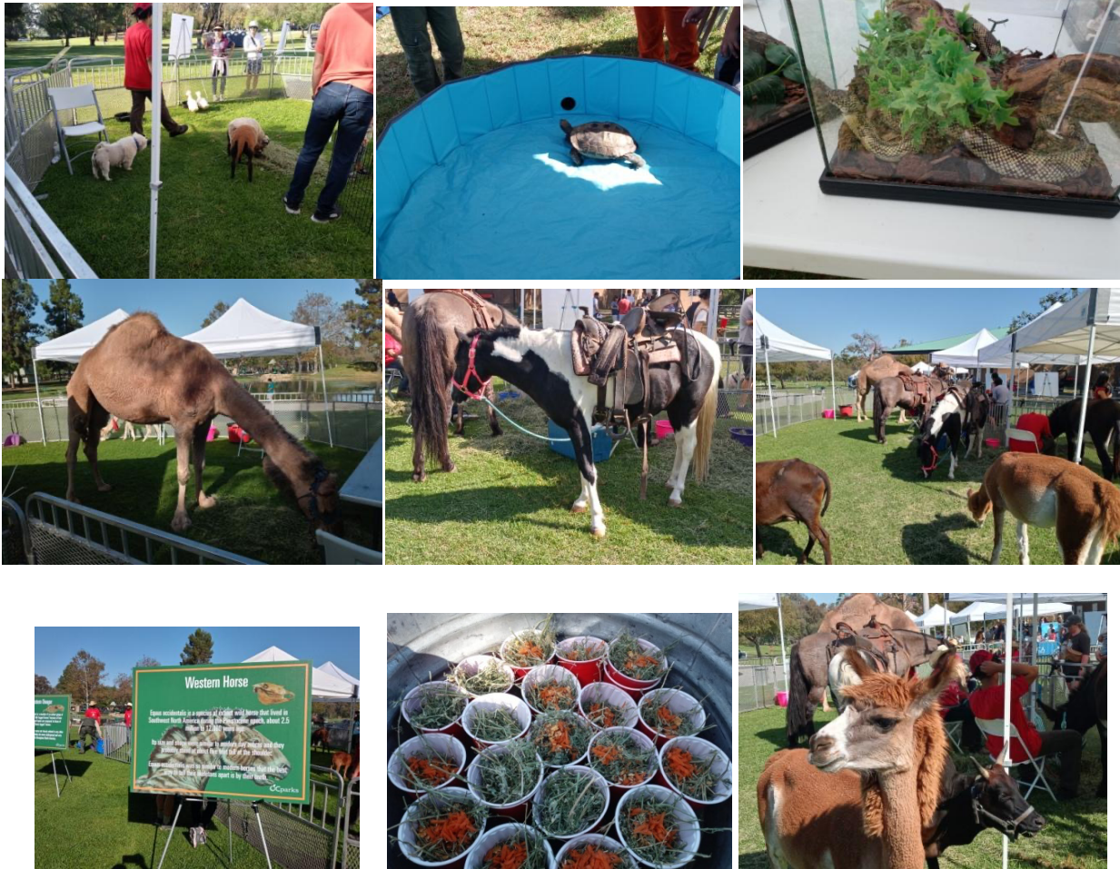
There were snacks for all

We had a great turn out at our booth, kids love Minerals (rocks).