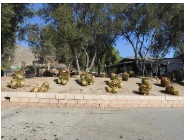
There are Beautiful Cactus gardens.