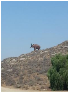
From the freeway you can see a Mastodon

There is something for everyone to see, Dinosaurs, Plants, Minerals, Animals, kid's activities and picnic areas. There are learning expeditions that cost $10.00 per child.