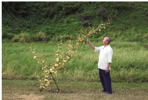
Prosperous Descendants , 2016 © Wu Ching

They grow along bamboo scaffolds made from bronze, with an array of bugs on top. This piece consists