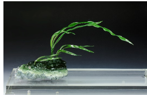
Wind Blowing © Huang Fu-shou

The two living masters whose work will be on display have practiced their crafts for a combined century. The gold that Wu Ching works is a malleable, brilliantly yellow metal associated with enlightenment in the Buddhist tradition. The jade that Huang Fu-shou carves is not one but two stones that can be called jade: jadeite and nephrite.