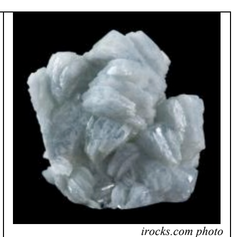
Barite : BaSO <sub>4</sub> Denton mine, Goose Creek Mine Group, Harris Creek Sub-District, Illinois - Kentucky Fluorspar District, Hardin Co., Illinois, USA 5.4 cm x 5.4 cm x 4.1 cm

Barite : BaSO <sub>4</sub> Locality: <u>Silius, Cagliari</u> <u>Province, Sardinia, Italy</u> 7.5 cm x 6.2 cm x 4.3 cm