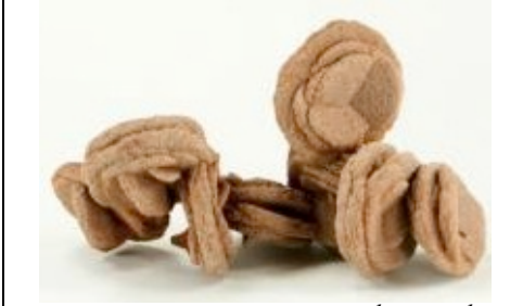
Barite "Roses" : BaSO <sub>4</sub> <u>Slaughterville, Cleveland Co.,</u> <u>Oklahoma, USA</u> 10.4 cm x 5.8 cm x 4.9 cm

Volume 89, Number 4 -- MSSC Bulletin, April, 2016