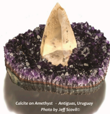
Calcite on Amethyst - Antiguas, Uruguay

FREE ADMISSION ★ FREE PARKING ★ RETAIL WHOLESALE FOR QUALIFIED BUYERS