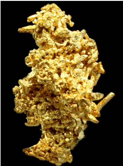
Round Mountain Mine, Nye County, Nevada, USA, North America