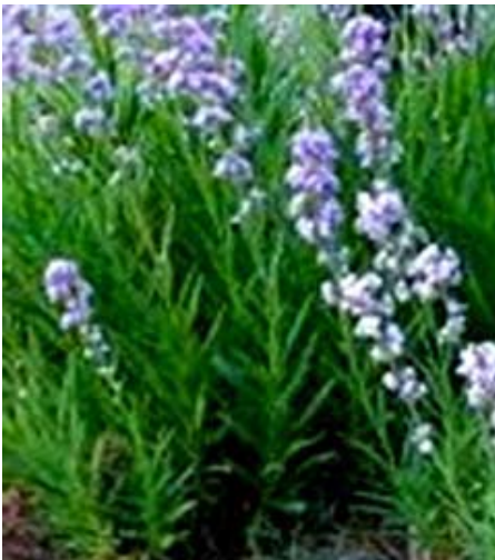
Poodle Dog Bush

Skin contact with this plant's needles results in a delayed outbreak of intensely irritating rash, blisters, itching and pain. Search and rescue squad leaders described it to me as being ten times worse than the most severe case of poison oak dermatitis. The effects can last for a month and the current best treatment products for poison oak - Zanafel and Technu - have little effect. Experts recommend initial over-the-counter pharmacy products containing hydrocortisone and seeing a doctor for a cortisone injection or other treatment options should blisters develop. When in the field avoid any contact with the plant! Wear gloves, long sleeves and pants. If you find yourself near the plant, wash your tools at the end of the day and wash your gloves and clothes separately from other laundry. Wash skin thoroughly with soap and water after contact with the plant or with clothes. I suggest that field trip leaders in California include this plant in their field trip safety briefings on potential site-specific hazards. Resources: http://www.socaltrailriders.org/forum/generaldiscussion/59360-poodle-dog-bush-toxicity.html http://articles.latimes.com/2011/jul/24/local/la-mepoodle-dog-bush-20110724 http://en.wikipedia.org/wiki/Turricula_plant Via CFMS Newsletter, July 2012