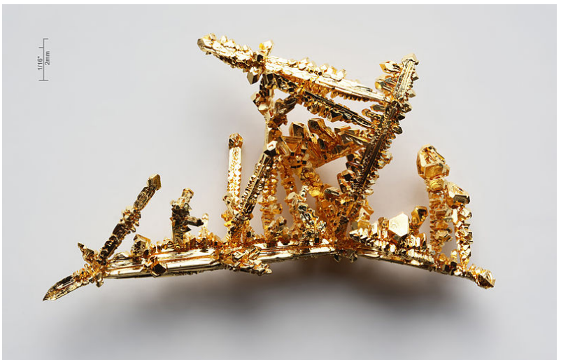
Bruce Carter sent us a picture of an exceptional specimen of gold crystals for us to enjoy.