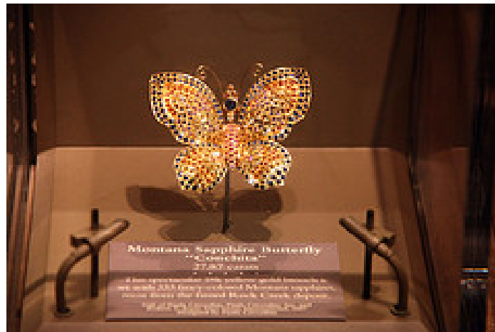
The Montana Sapphire Butterfly in the gem collection of the Smithsonian Institution.