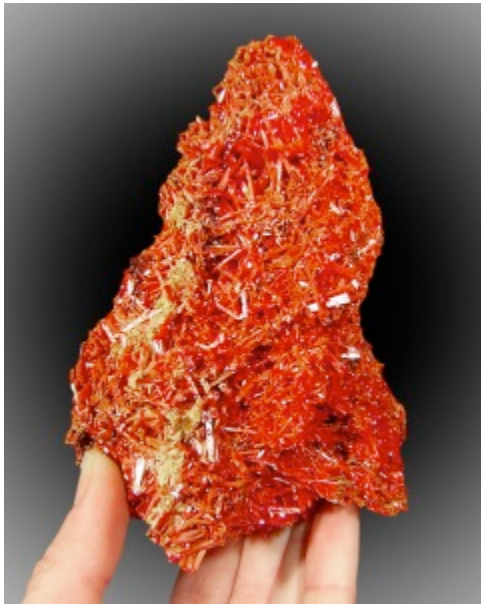
The mesmerizing, brilliant red color of crocoite from Tasmania.

true color. She wrote back that the color was great, but that she was still disappointed that it didn't look that color in her display cabinet! Confusion over this issue prompted us to include a link in all our listings to an article detailing what we do to ensure accurate color representation in our photos (click here to read the article). To sum it up, we recognize sunlight as the universal standard that everyone, anywhere in the world, can use to judge color in a mineral specimen. That's why we use TruColor lighting that is as close as possible to 5000° Kelvin, which is the color temperature of sunlight. You might consider using similar lighting in your display cabinet to show off your minerals at their best.