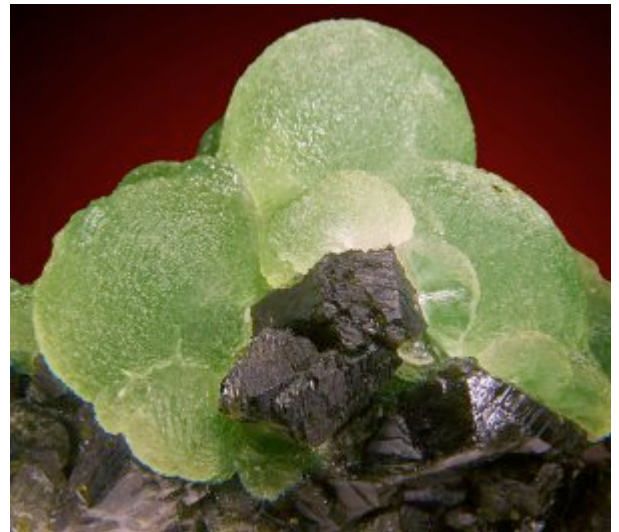
Prehnite with epidote, showing the appeal of dramatic contrast

Similarly, light colors set on dark colors appear brighter and more vivid, and also clearly define crystal edges and enhance three-dimensionality, thus making the specimen more appealing to the eye.