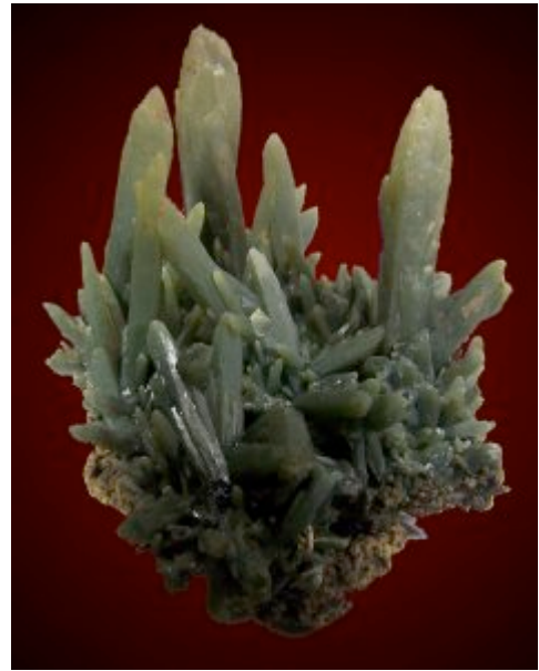
Prase quartz from Serifos Island in Greece - an excellent example of the beauty of crystals interacting with space

Are they presented in a balanced fashion? Or, are they crowded together, all on one side, or too near the top or bottom? Are they of varying sizes, proportional to one another, or all one size? Is the color bright and appealing, as appropriate for the species? Are individual crystals sharp and well-defined? Do the crystals and matrix relate well to each other in size, ratio and form? Does it have an attractive composition, with a pleasing sculptural or architectural feel to it, with appealing three-dimensional viewing angles? Do the crystals interact with space in a pleasing way?