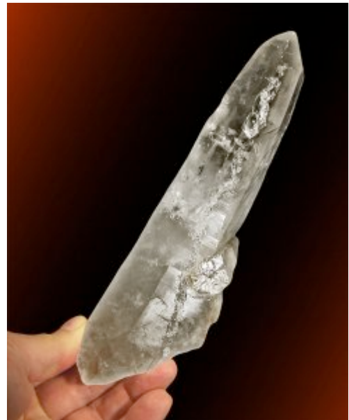
This Brazilian quartz crystal actually was struck by lightning! ;)