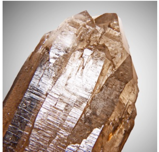
Quartz - an example of vitreous luster

Because reflected light is highly appealing to the eye, specimens which have the glint of light from a cut diamond or the gleam of gold are perceived to be more attractive than those with dull surfaces. Transparency, which is closely related to luster, is highly desirable in the crystals on a specimen.