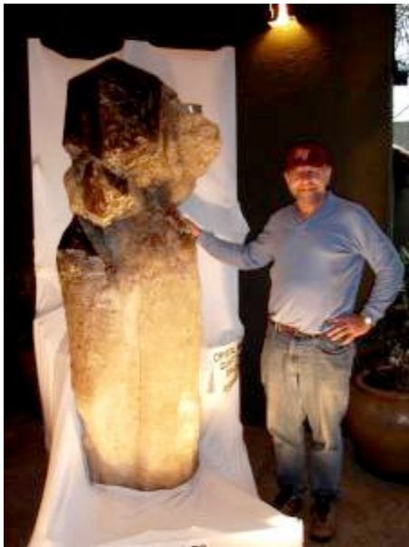
Who says size doesn't matter in a quartz crystal?

Large, perfect crystals are rare, and are thus more desirable to a mineral collector than smaller, imperfect crystals of the same species. It's only human: almost everyone wants to own the biggest, the brightest, or the best "shiny objects". Mineral collectors are no different. On the other hand, keep in mind that while a 6" tourmaline crystal is rare and thus more valuable than a 3" one, a near-perfect, transparent 3" one is more appealing than a larger one that is flawed.