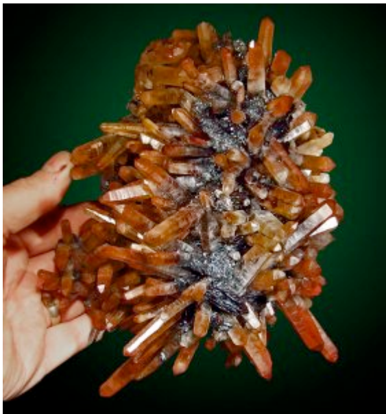
A beautiful red quartz specimen from Fujian, China

quality that gives pleasure to the mind or senses and is associated with such properties as harmony of form or color, excellence of artistry, truthfulness, and originality.” We all know that beauty is in the eye of the beholder, so what is perceived as beautiful will vary from person to person. Nevertheless, when looking at a mineral specimen, there are some elements of beauty that are pretty universal. For example, how are the crystals placed on the specimen? Are they grouped nicely?