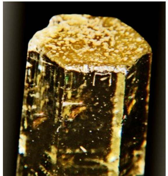
A gemmy heliodor crystal showing excellent transparency

Because reflected light is highly appealing to the eye, specimens which have the glint of light from a cut diamond or the gleam of gold are perceived to be more attractive than those with dull surfaces. Transparency, which is closely related to luster, is highly desirable in the crystals on a specimen.